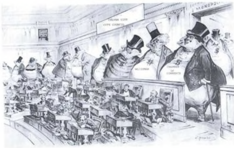
"BOSSSES OF THE COUNCIL" CIRCA, 2018